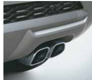
Twin tip exhaust