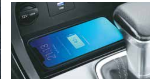
1 st & 2 nd row smartphone wireless charger