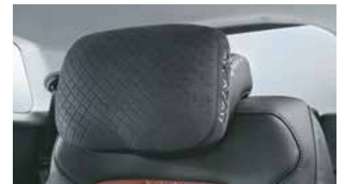
2 nd row headrest cushion