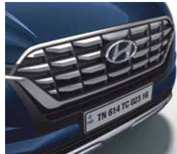
Dark front chrome grille*