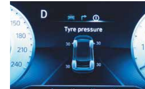
Tyre pressure monitoring system (Highline)