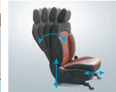
Power driver seat - 8 way