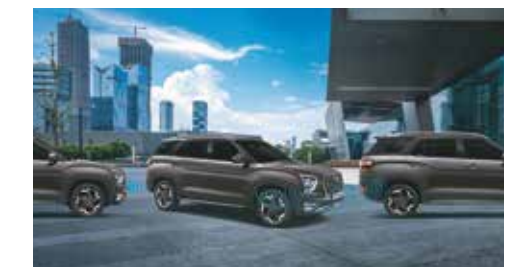
Parking assist: Front and rear parking sensors

Other features: Emergency stop signal | Speed alert system | Speed sensing auto door lock | Driver rear view monitor Impact sensing auto door unlock | Child seat anchor (ISOFIX) | Electric parking brake with auto hold