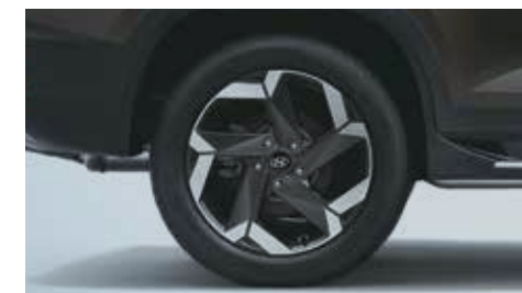
Rear disc brakes