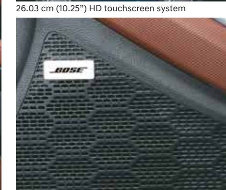
Bose premium sound system (8 speakers)