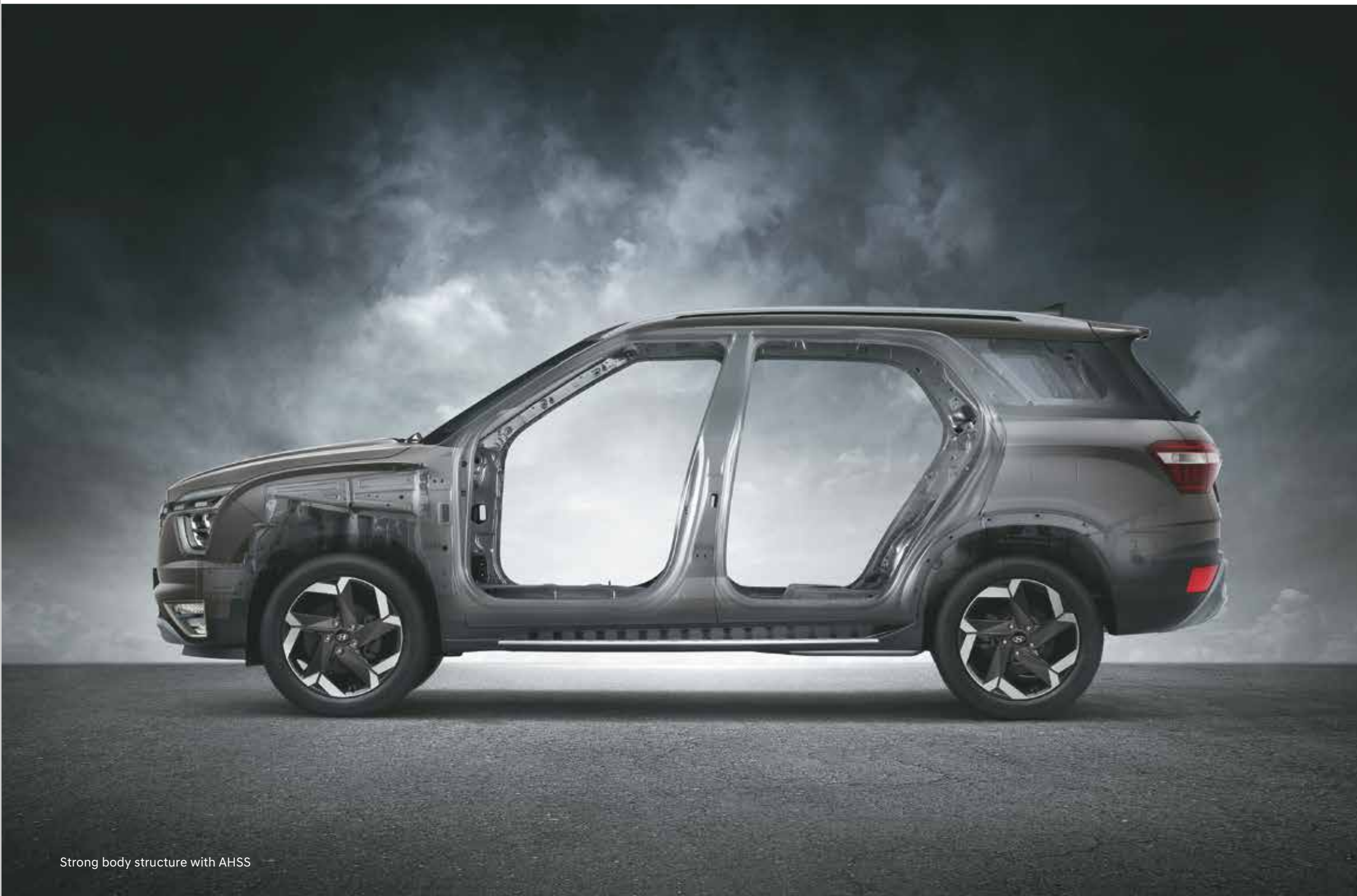
Strong body structure with AHSS