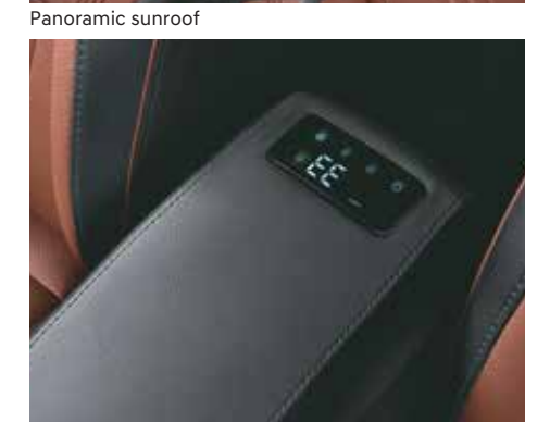
Auto healthy air purifier with AQI display