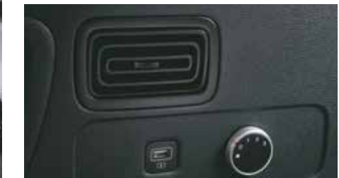
3 rd row AC vents with speed control (3-stage)