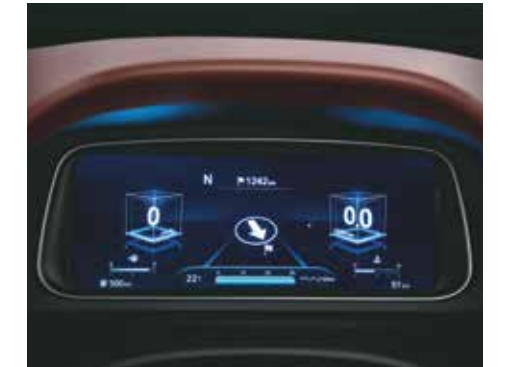
26.03 cm (10.25") Multi display digital cluster with personalized themes