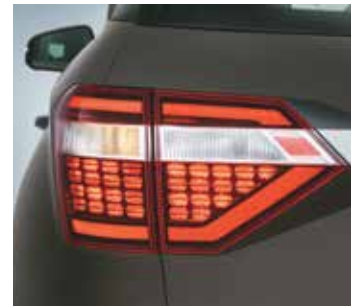
Honey-comb inspired LED tail lamps