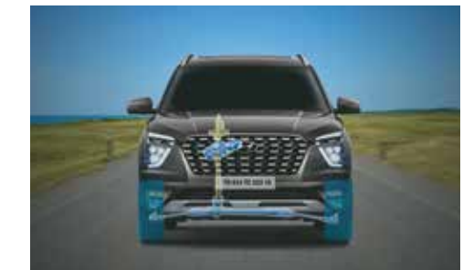
Vehicle stability management (VSM)