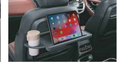
Front row seatback table with retractable cup-holder and IT device holder