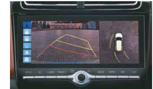
Surround view monitor (SVM)