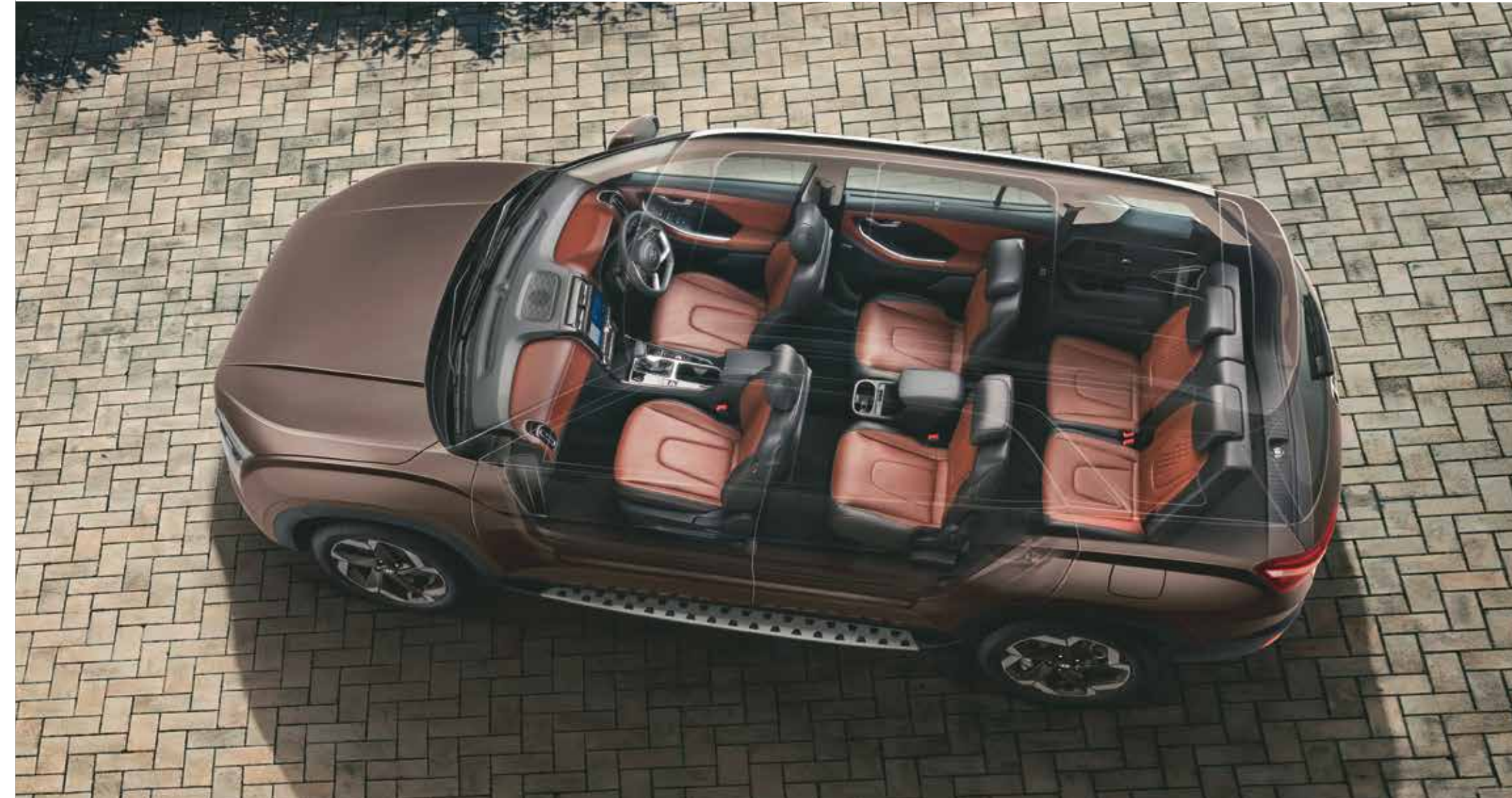
Leather pack: Perforated D-cut steering wheel | Perforated gear knob | Cognac brown and black seat upholstery | Door armrest

The interior of the Hyundai ALCAZAR immerses you in uncluttered design. Complete with premium dual tone cognac brown interiors, the 64 colours ambient lighting offers a regal touch to the cabin. Carefully selected materials accentuate the aesthetic, complete with Hyundai ALCAZAR's advanced technology, ensuring that your entertainment knows no bounds. Experience serenity thanks to a voice controlled panoramic sunroof and an auto healthy air purifier. The tranquil sanctuary is also outfitted with an HD touchscreen system with powerful Bose premium sound system, immersing you in a rich and balanced premium audio experience.