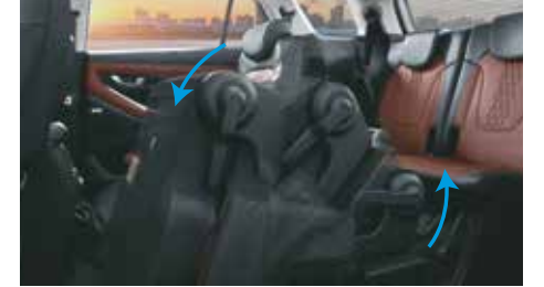
2 nd row - one touch tip tumble captain & split seats