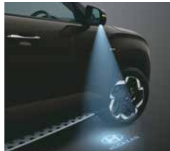
Puddle lamps with logo projection