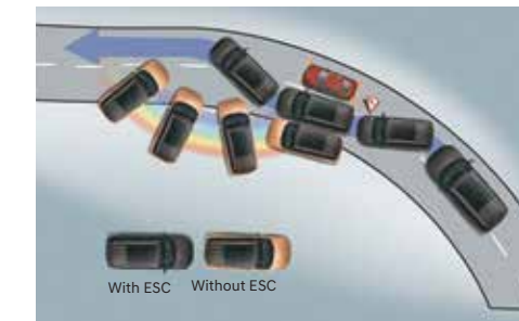
Electronic stability control (ESC)