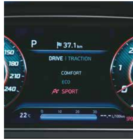
Drive mode select

Other features: Welcome greetings | Voice recognition commands (I want to see the sky / What's the Indian cricket score? / When is the soccer match?) | Bluelink integrated smartwatch app