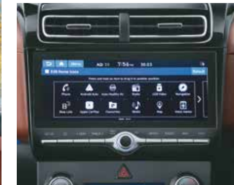
26.03 cm (10.25") HD touchscreen system