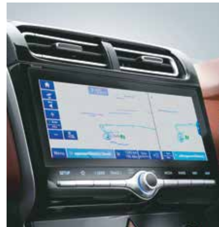
Advanced Bluelink with OTA map updates