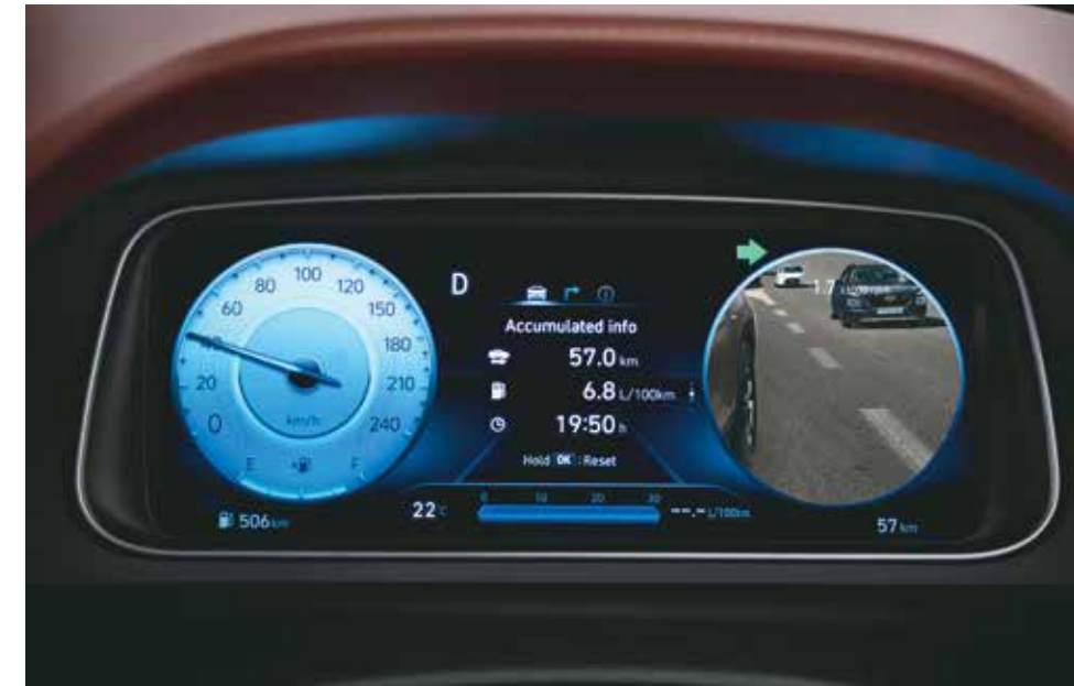
Blind view monitor (BVM)