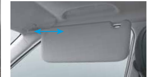
Front row sliding sunvisor