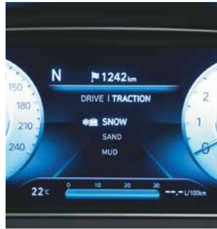
Traction control modes