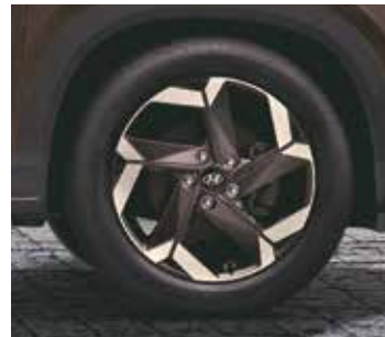
R18 (D=462 mm) Diamond cut alloys