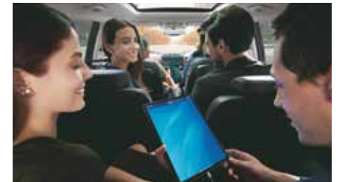
4 USB chargers for 3 rows