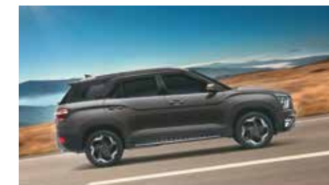
Hill start assist control (HAC)